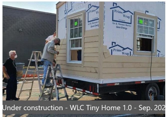
Under construction - WLC Tiny Home 1.0 - Sep. 2022

If you have questions, please contact me at 651-739-5144 x230 or sabbannm@woodburylutheran.org