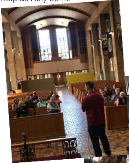
Trinity First Lutheran School

Becoming more like Jesus means seeing the world through Jesus' eyes. We walked and prayed, interacted and processed all the people groups that God has made and has brought to our backdoor. Our call as disciples is to love where we live. Fill us & help us Holy Spirit!